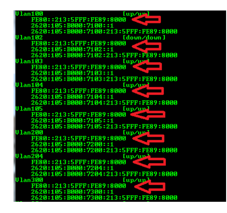
Figure 1 - All SVIs have the same link local address because they use the same virtual MAC address for their interfaces.

ceases within the building. This scenario only presents itself on routers that have the same MAC address and thus same link-local address on each switch virtual interface (SVI) Figure 1.